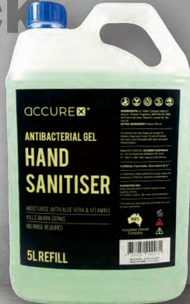
5L SANITISER GEL REFILL